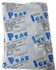
Ice Peak Ice Gel