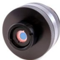
High Voltage Motor Protection Unit