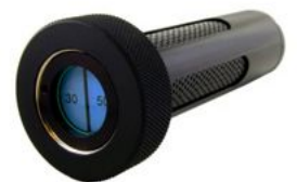
Metal Panel Mounting Desiccators