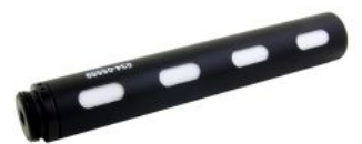
Hydrocarbon Adsorption Unit